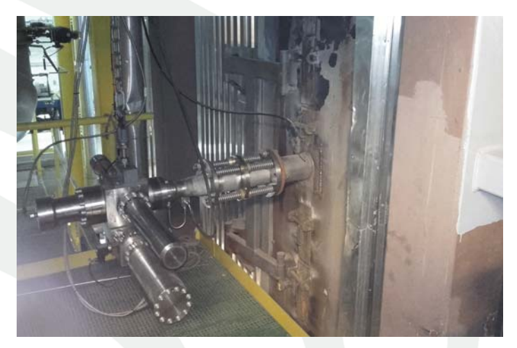
Shock Pulse Generator installed at Sarpsborg