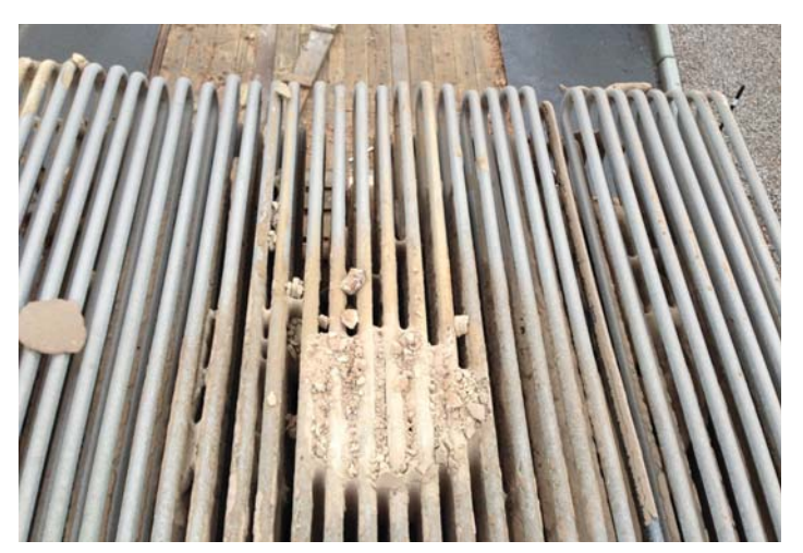
After: Tubes removed from the boiler after installing a Shock Pulse Generator – much cleaner than tubes in photo to left of page