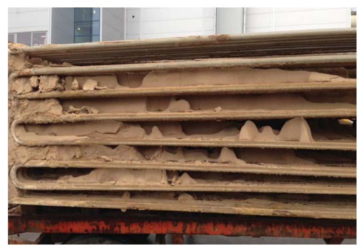
Before: Tubes removed from the boiler before installing the Shock Pulse Generator

The Plant Manager commented — "Without SPGs we wouldn't be able to run for 6 months – so it is much more efficient than only shot cleaning"